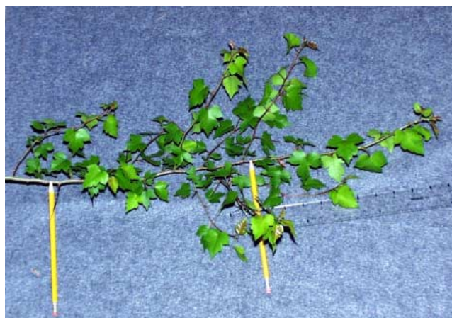
Figure 2. Twig growth on a young tree should be 9 to 12 inches per year. The space between the first two bud scale scars (indicated here by the pencils) is last year's growth.

12 inches or more per year (Figure 2). Large, mature trees may grow only 4 to 6 inches per year.