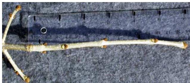
Figure 1. Gauge a tree's growth in the current year by the distance between the tip of a twig and the first bud scale scar.

Determine general tree vigor by checking the growth of several twigs during the past three or four years. Twig growth on most young trees should be 9 to