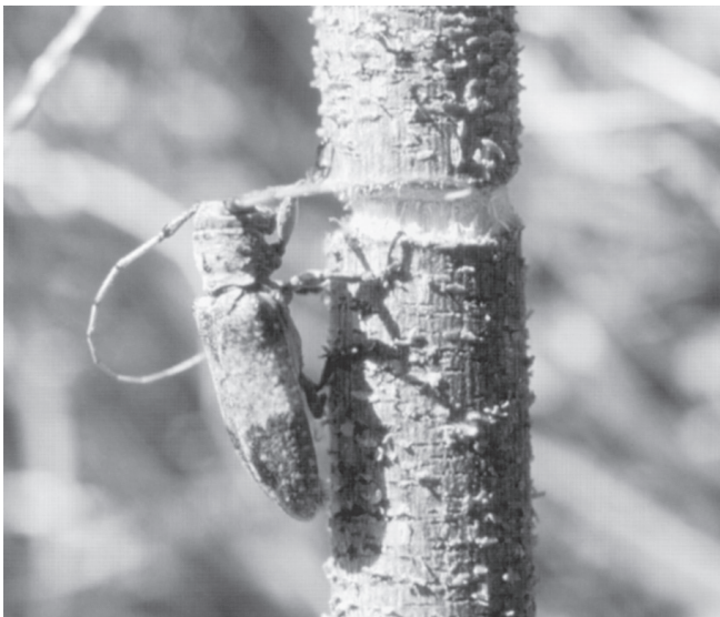
Figure 1. Twig girdler.

The adult beetle is about three-fourths of an inch long, stout, grayish-brown with a lighter colored band across its elytra (wing covers) and has antennae as long as its body (Figure 1).